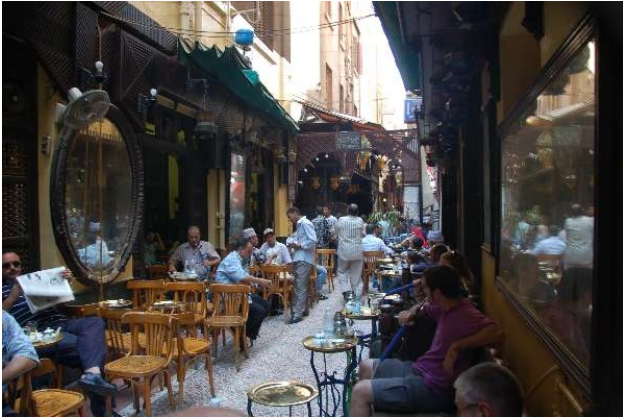
Khan El Khalili Bazaar – Cairo, Egypt

There are some levels of Christian growth that we can only attain through the “ doorway of suffering. ”